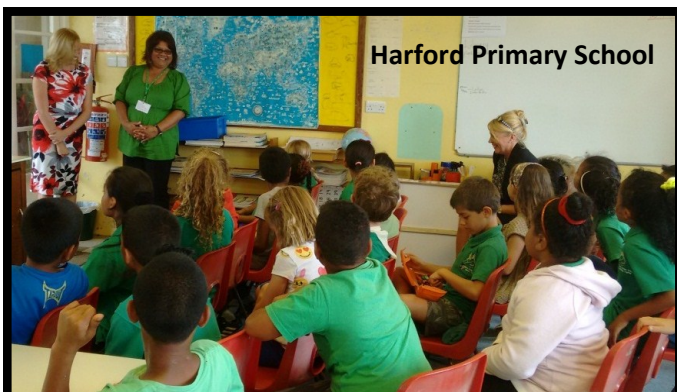
Harford Primary School