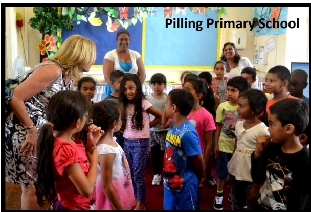
Pilling Primary School