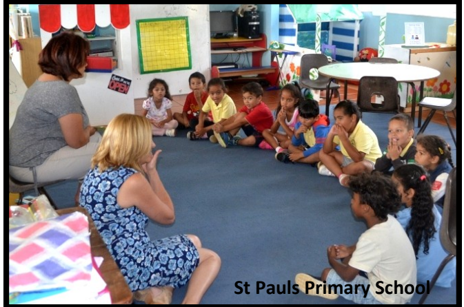
St Pauls Primary School