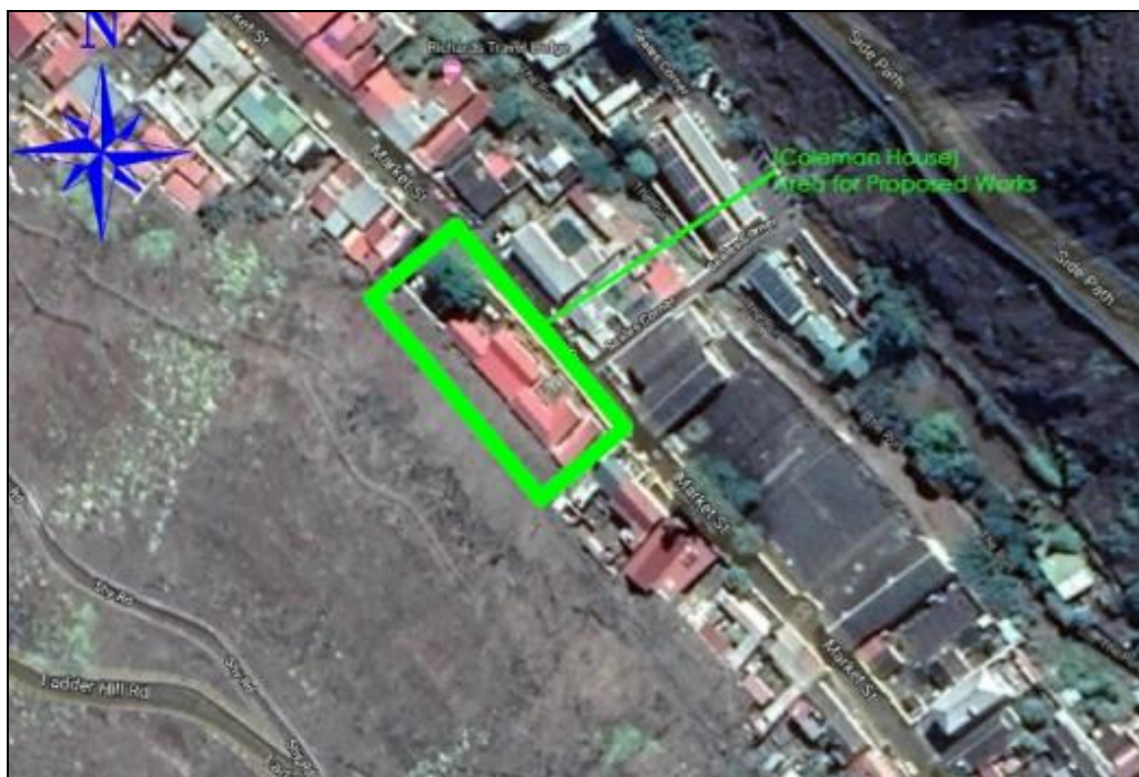
Diagram 1: Locality

The application site is at Coleman House, Jamestown. The complex is currently used as the Police Station. The development is designated within the Intermediate Zone and Jamestown Conservation Area.